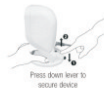
Press down lever to secure device

Durable, rugged yet elegant – TVS-E's BS-L301 Platina has built in stock absorption feature that makes it highly durable while its elegant and stylish design enhances the aesthetics of your store.