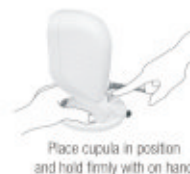
Place cupula in position and hold firmly with on hand

Vacuum pad for convenient operation – The suction cap ensures the scanner is fixed to the surface while you scan numerous items comfortably.